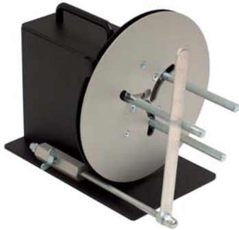
MC-11 with APG-MC

The MINI-CAT (MC) Label Rewinders are the world's most popular low-price Label Rewinders. They are capable of rewinding label rolls up to 125mm wide (115 mm for MC-11), up to 220 mm in diameter at speeds up to 50 cm/sec.