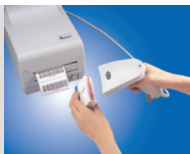
> Standalone mode with scanner