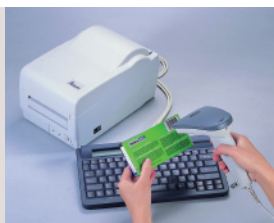
> Standalone mode with Argokee

The OS-2140 thermal transfer printer provides advanced functions and performance in a durable, space-saving design. A rapid print speed of 4 inches per second ensures increased efficiency and the large 4M Flash and 8M DRAM onboard memory handles a broad range of applications. The USB 2.0 interface ensures compatibility with a variety of computers and other devices. Other improvements include much quieter printing compared with other printers in this class. The printer's durable, high-impact ABS housing and all-metal print mechanism assure years of dependable performance. An optional internal Ethernet capability (OS-2140E) allows easy integration into a network. The printer supports 1D/GS1 Data Bar, 2D/Composite codes and QR barcodes. Style, ease-of-use, space-savings, price, and printing performance are what define the new OS-2140 (OS-2140E) thermal transfer printer.